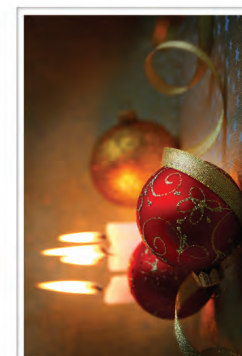
A Candlelight Christmas