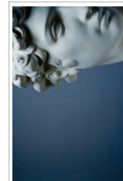
Psalms, Canticles & Love Songs