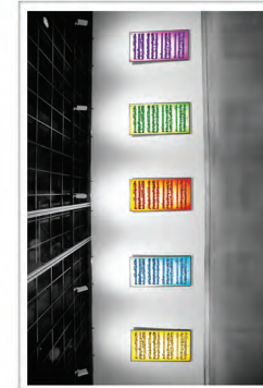
Music At An Exhibition