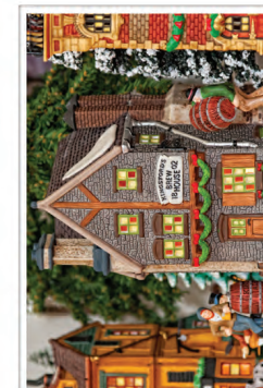
A St. Louis Family Christmas